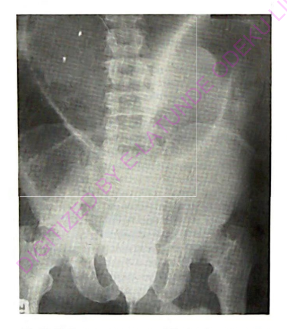
Fig. 2. Barium enema in an adult showing enormous distension of the sigmoid colon and thickening of the bowel wall.