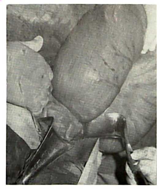
Fig. 3. Shows gross distension of the sigmoid colon: the distended loop was filled with blood, and gangrene was evident.