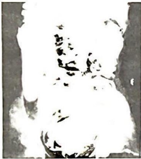
Fig. 2: Photograph of barium enema film showing ahaustation of rectosigmoid and descending colon.