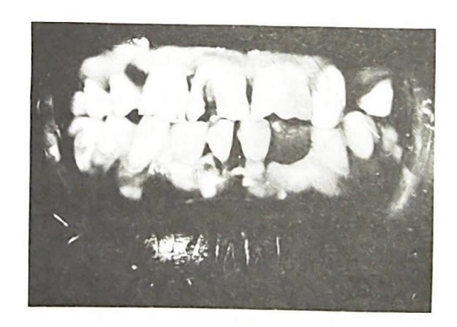
Fig. 1: Intraoral photograph of a battery charger showing severe erosion of labial and incisal surfaces of the anterior teeth.

claimed to take alcohol occasionally. Likewise, the percentage of the techniques of tooth-brushing and types of tooth cleaning devices by both groups are very similar (Table 4). Therefore these other forms of actiological factors of toothwear seemed to play no major role in the difference observed in the prevalence of tooth erosion in the two groups in this study. It is thus shown from this study that exposure to acid solutions and fumes by the battery chargers may cause tooth erosion (Fig. 1). Dentists must be aware that highly erosive acids are being handled by this group of workers. Prevention through oral health education targeted at this group of subjects and early diagnosis are very important.