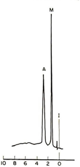
Fig. 1. A typical analytical chromatogram of aspirin, using a Hypersil 5-ODS column ( 50 \times 45 \text{ mm i.d.} ) with a mobile phase of methanol/water (20/80, v/v) pH 2.5 with detection at 240 nm. 1 = injection, M = internal standard and A = aspirin.