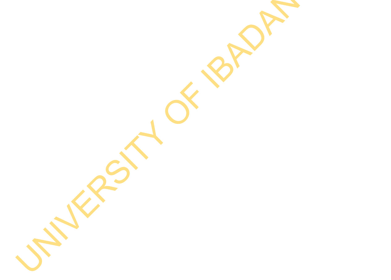
Table 4. 3: Changes in demographic and socio-economic characteristics among youths in Chad, Middle Africa

In Nigeria (Table 4.6), the percentage change for young males without education increased by 34.8% between 2008 and 2018 while it declined slightly among young women (7.9%). However, the percentage of those with higher education increased among men (21.1%) and women (26.3%). There was a slight increase in the proportion of urban residence compare to rural residence. Exposure to media decreased among young men (from 69.8% to 53.5%) while the level among women was the same in 2008 and 2018 (about 50.0 %.)